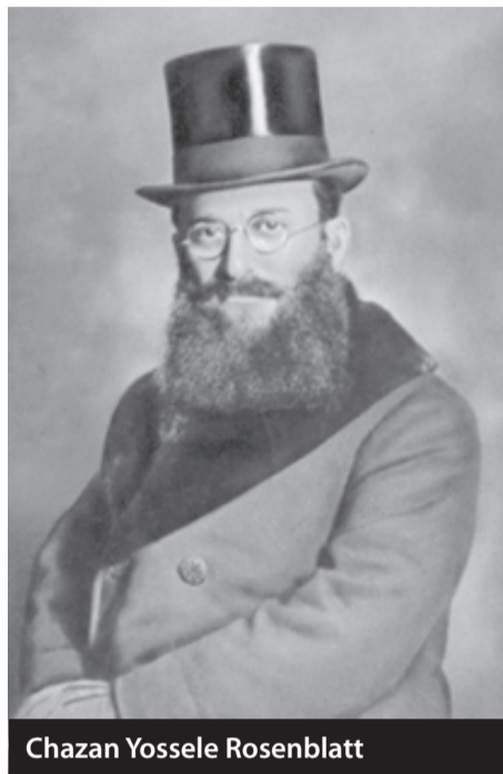
Chazan Yossele Rosenblatt